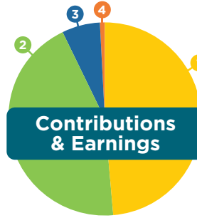
Contributions & Earnings