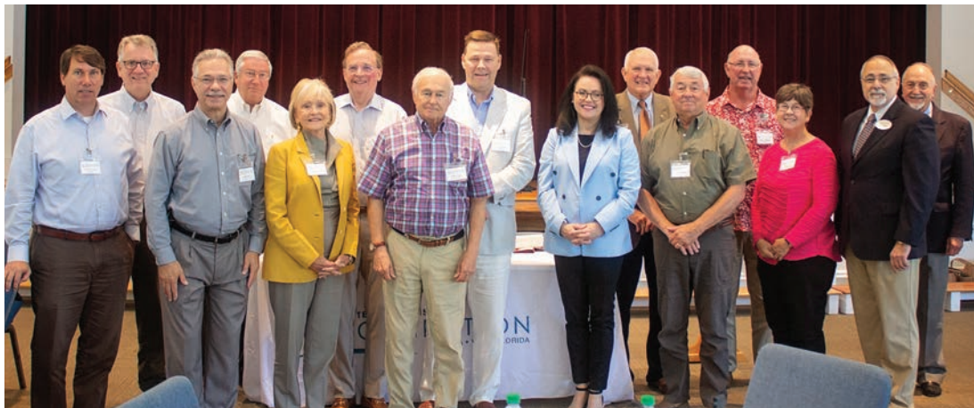
May 18, 2022, Spring Foundation Board of Directors meeting at Dothan FUMC