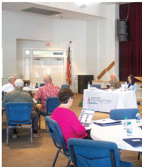
May 18, 2022, Spring Foundation Board of Directors meeting at Dothan FUMC

Additionally, we went through the process of applying for and getting registered to offer Charitable Gift Annuities and adding other gift opportunities such as Donor Advised Funds and a stock gifts service.” (for more details on ways to give through the Foundation, see page 5).