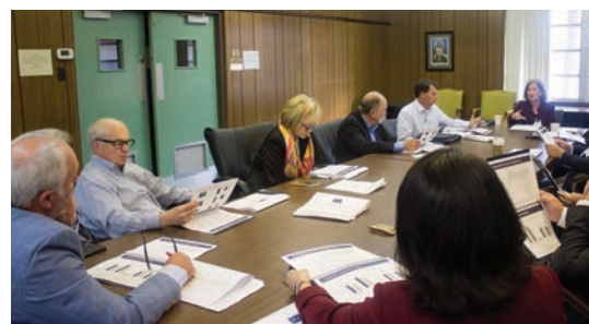
Foundation Board of Directors Investment Committee meeting at Blue Lake

to meet the specific needs of our churches, and as the needs of our churches have and will continue to evolve, your Foundation will continue to look for ways to aid your church in growing funds for continued ministry.