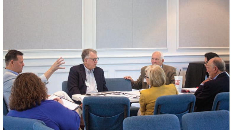
Executive Committee meeting at the Spring 2022 Foundation Board of Directors meeting

funds, development of local church endowment programs, short and long-term options for reserve funds, loans for building projects, and educational programs on a number of subjects.