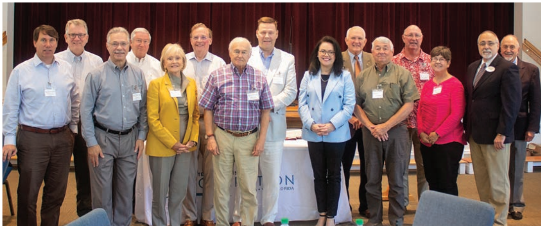
May 18, 2022, Spring Foundation Board of Directors meeting at Dothan FUMC