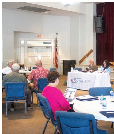
May 18, 2022, Spring Foundation Board of Directors meeting at Dothan FUMC

Additionally, we went through the process of applying for and getting registered to offer Charitable Gift Annuities and adding other gift opportunities such as Donor Advised Funds and a stock gifts service.” (for more details on ways to give through the Foundation, see page 5).