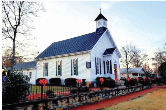
Present Maplesville UMC location with fresh paint and new shutters on Railroad Street

Maplesville UMC is a beautiful small town church initially constructed in the 1870s on the main road that runs through Maplesville, Alabama. The city of Maplesville was frequently used as a campground by farmers on their way to sell their goods to stores in Selma, Alabama. Maplesville UMC was the first church built in town and was originally shared with several other religious groups and served as a school from time to time.