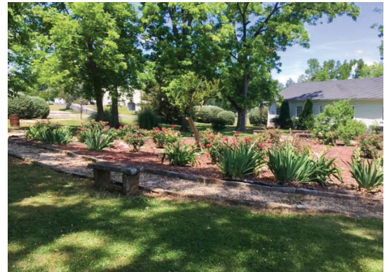
Maplesville UMC's Walking Garden

In 1888, Maplesville UMC was dismantled and moved to its present location facing the city's railroad on Railroad Street, and the original plot of land is where the Maplesville Cemetery is today. Moving the church allowed train passengers to see that the small town had a church. The sound of the train rolling through often frightened the early church members' horses as it passed, and to this day, the train can be heard rolling through on Sunday mornings in the middle of the pastor's sermon.