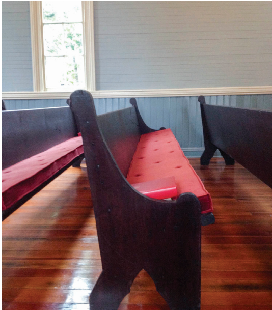
Interior of Maplesville UMC

Maplesville UMC is a beautiful small town church initially constructed in the 1870s on the main road that runs through Maplesville, Alabama. The city of Maplesville was frequently used as a campground by farmers on their way to sell their goods to stores in Selma, Alabama. Maplesville UMC was the first church built in town and was originally shared with several other religious groups and served as a school from time to time.