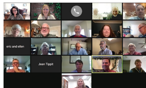
Fall Board Meeting on Zoom (December 10, 2020)

We are incredibly grateful for the leadership and dedication of our Board of Directors and AWF Conference District Superintendents that continue to further the mission and vision of the Foundation. We are looking forward to new things in 2021 and beyond for our Methodist and historically Methodist churches!