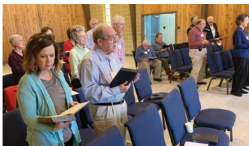
March 2020 Memorial Celebration

a guest speaker to the March 2020 gathering to review current investments held through the Foundation and discuss a variety of giving options (including Charitable Gift Annuities and IRA gifts through a Qualified Charitable Distribution [QCD]). These new giving avenues offer opportunities for Wesley Heirs to continue growing their funds and to annually support Blue Lake, Sunshine Camp, Discovery Camp, the UM Foundation, and their bi-annual gatherings.