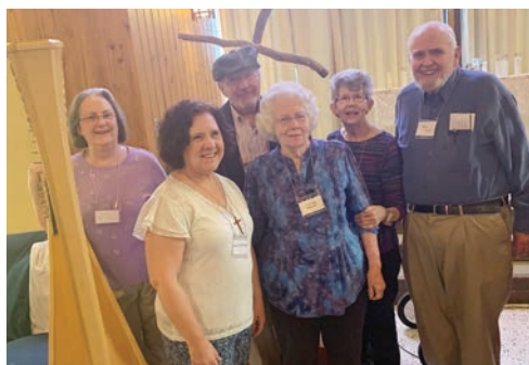
Memorial Celebration Leadership Team

Wesley Heirs was founded in 1983 as an AWF Conference ministry for retired ministers and their spouses. Members enjoy fellowship gatherings surrounded by like-minded peers