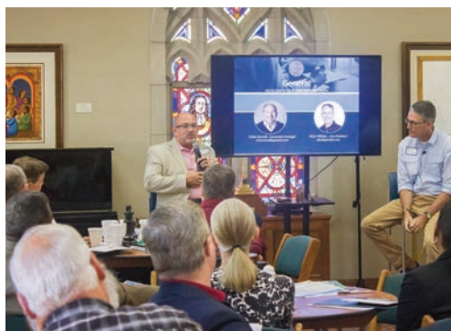
Game Changing Leadership, September 6, 2019, Montgomery FUMC