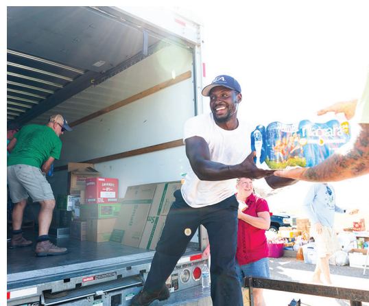
Continued on page 2

relief efforts, churches are on their way to recovery, but the needs in affected areas are still great.